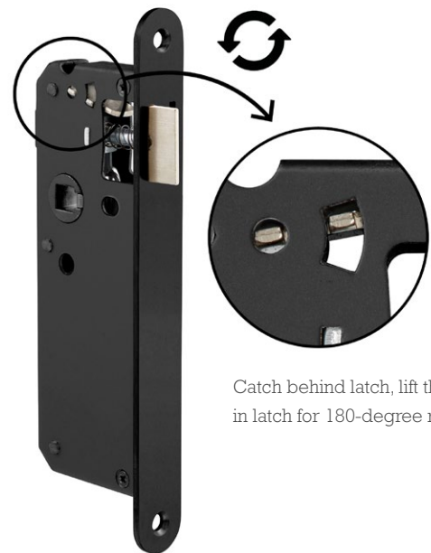
Catch behind latch, lift then push in latch for 180-degree rotation