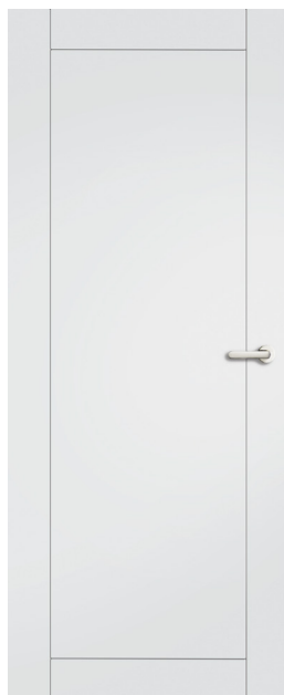
Deco 4s Solid Core