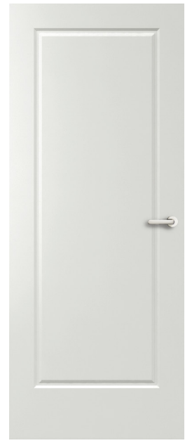
Balmoral PAL 1 Solid Core