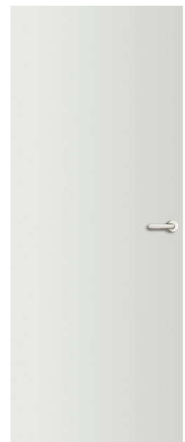
Flush PMDF Solid Core